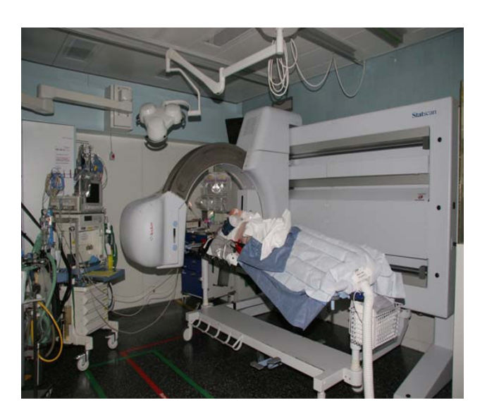
Figure I Lodox Statscan device in Inselspital ED.

LS has also emerged as a useful diagnostic tool in other areas of medicine: recent publications have reported on the effective use of the device in pediatric trauma, pediatrics, neurosurgery, internal medicine, and even in forensic medicine. To the best of our knowledge, this is the only FDA-approved device of its kind currently used in emergency departments. A new full body low dosage 2D/3D scanner (EOS <a href="http://www.biospacemed.com">http://www.biospacemed.com</a>) has been recently introduced to the international market, but does not seem to be applicable in injured patients.