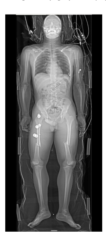
Figure 2 Whole-body scan of a trauma patient with bilateral femur fractures.

In a clinical trial with the LS, Boffard et al compared its effectiveness in detecting injuries with the standard ATLS X-ray protocol [8]. Compared to conventional a.p. radiographs, the authors reported no loss of information for the chest and pelvis, cervical spine, the cervicothoracic junction, or for long bones (Fig. 2). A study by Beningfield